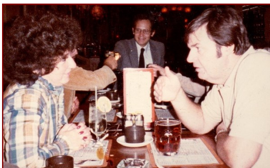
Top Left: International meeting of ISAAC colleagues