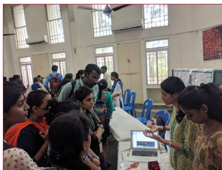
Open Day at Vidya Sagar, Chennai, India