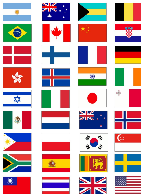
Delegates represented at ISAAC 2018