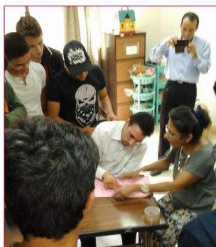
Egypt Awareness Workshop, St. Peter's School

To find even more AAC awareness activities worldwide, search #AACaware18 on Twitter.