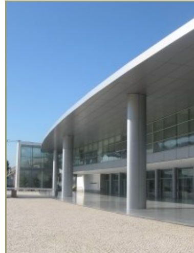
Lisboa Congress Centre

Click here to find this article in translation