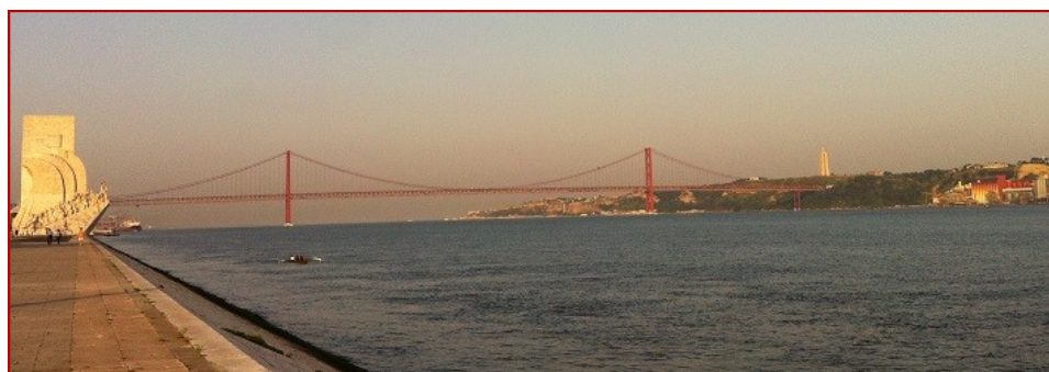
Monument to the Discoveries (Padrão dos Descobrimentos) and 25th of April Bridge (Ponte 25 de Abril), Lisbon, Portugal

Where: Lisboa Congress Centre, Lisbon, Portugal