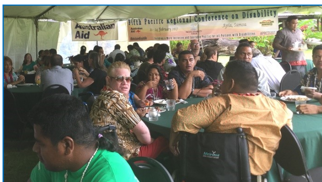
Lunch outside the conference venue