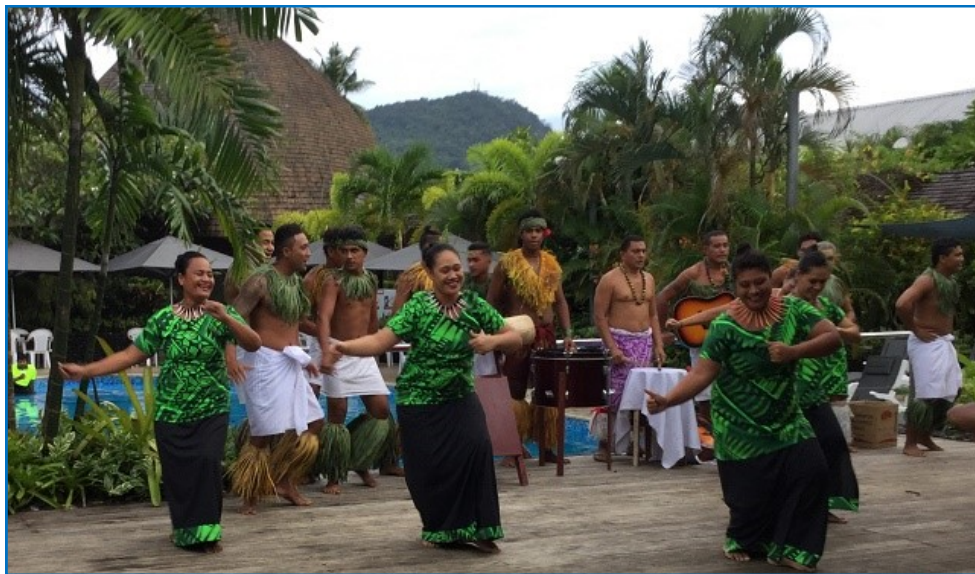
Traditional Samoan dancing, at the Fifth Pacific Regional Conference on Disability