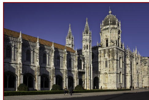
25th of April Bridge / Jeronimos Monastery