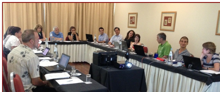
Conference Co-chairs, ISAAC Executive Board, and staff at ISAAC 2014 planning session, July 2013