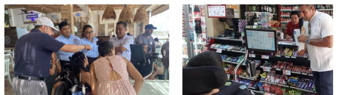
Figure 1. Photo of ambassadors at a local restaurant and store during a community visit

Ambassadors encouraged businesses to support accessibility efforts and handed out brochures and shared links to videos and websites. Businesses received a "communication access" sticker, a simple but powerful symbol letting AAC users (and others) know: You are welcome here. Efforts will be made to facilitate successful communication.