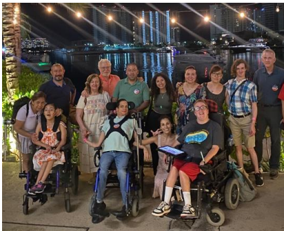
Photo of NAACA team at ISAAC Cancun Conference.

We are creating a culture where every communication style is valued, supported, and celebrated.