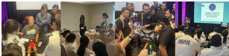
Figure 2. Photos of formal sessions with ambassadors at hotels, police, and conference center

Ambassadors also led one-hour training sessions for service professionals, including hotel staff, police officers, hospitals, transport services and event coordinators. These sessions provided practical strategies tailored to each group's role in supporting AAC users. Participants learned how AAC works and why it matters. Also, service professionals had opportunities to talk about common misconceptions and practice respectful communication by engaging directly with AAC ambassadors.