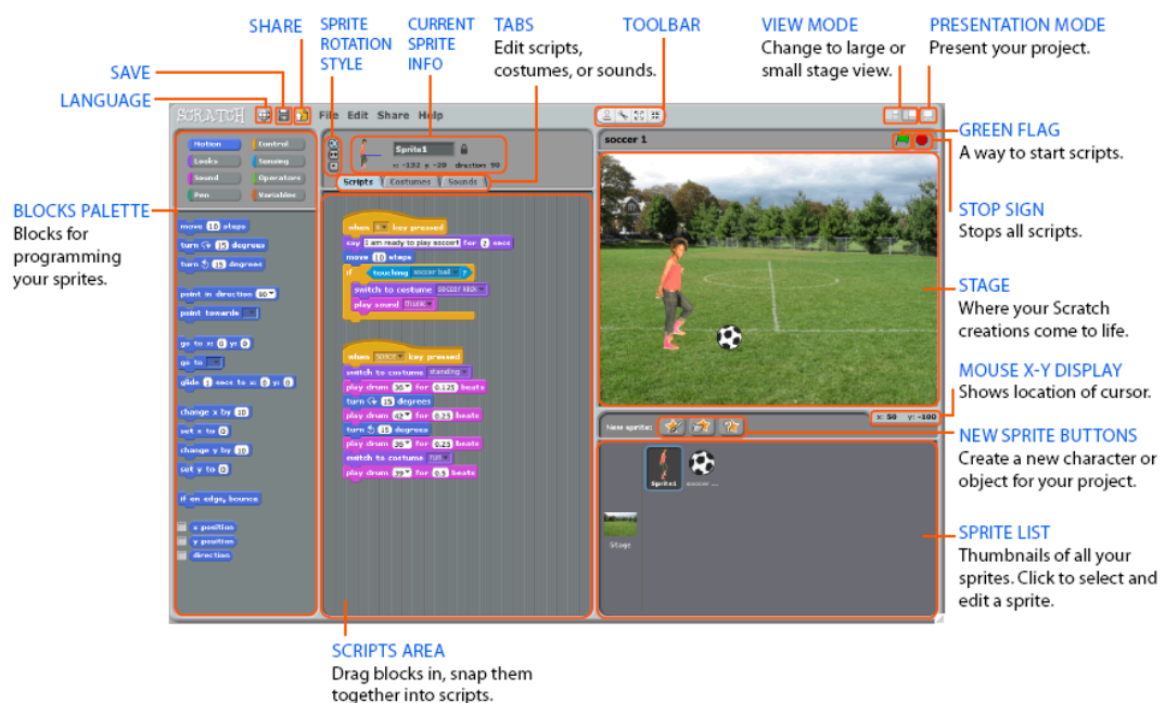
Figure1 Scratch Graphicsoftwaredevelopment platform

Scratch works are released in the Scratch website publicly ( http://scratch.mit.edu ). Students can share, discuss and re-organize the other's work. Currently, there are more than 989,570 registered users, the number reaching 292,980 who did scratch works. The person Using Scratch aged from 5 until 70 years old. The number of 12 years-old user is reached 50,000. The age distribution is shown in Figure 2. But there is no any report or literature that can be searched about the deaf community using this platform.